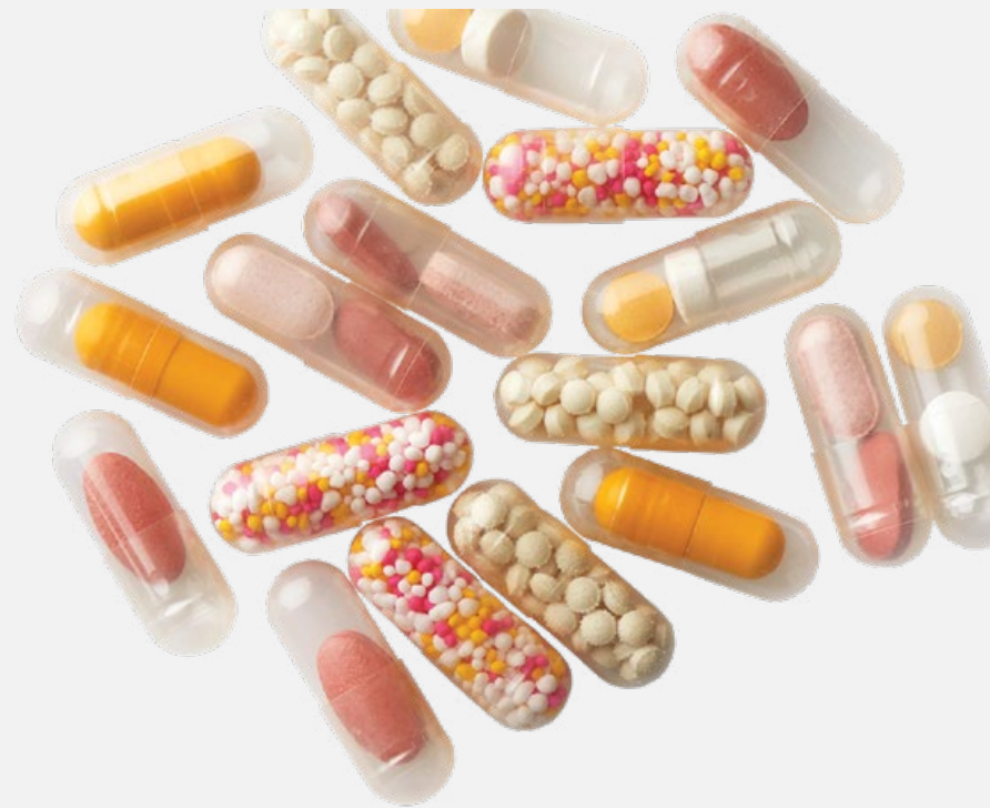
Possibilities of filling capsules with different combinations using CODE

Liquids and pellets, tablets, micro-tablets, capsules, and their combinations in liquid